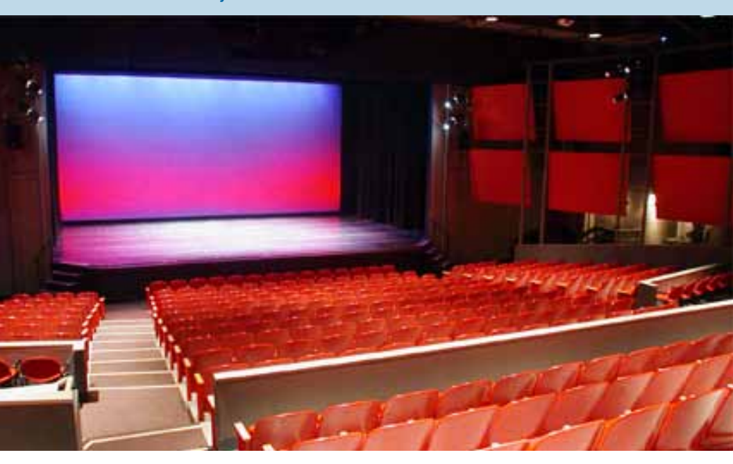
Cowell Theatre, Fort Mason