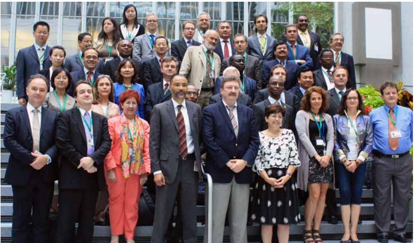
Council members posed for a group photo at the end of the first day

Delegates considered Agenda Item 8, Annual Country Portfolio Evaluation Report 2012 and Management Response, on Tuesday morning. In connection with this item, the Council considered GEF/ME/C.41/03, Annual Country Portfolio Evaluation Report 2012 , as well as GEF/ME/C.42/04, Management Response to the Annual Country Portfolio Evaluation Report 2012 , which presents the Management’s conclusions on the report prepared by the EO. The former was noted to demonstrate shifts indicating greater country ownership of the evaluations, which were reported to be increasingly undertaken with national teams that work independently from the government. The recommended decision was drafted based on conclusions from the report and Management response. During the discussion, participants