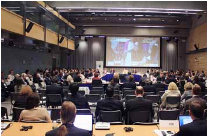
The World Bank's Lewis T. Preston Auditorium during the meeting

considered trade-offs that would be made in accepting the recommendations, and if anything would be lost if the tracking requirements were made more flexible for multi-focal areas.